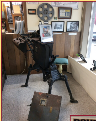
The original A Power's Cameragraph No. 6B Motion Picture Projector.

The Cynthiana Harrison County Museum first opened its doors in July 1994. Housed in the historic Rohs Movie Theatre on S. Walnut St. the museum is a step back in time displaying over 4000 artifacts showcasing the community's Military, Education, and Agricultural Histories. Rooms are also devoted to items from childhood, daily life, local industry, and the town's churches, healthcare police and fire departments.