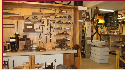
“Tools of the Trade” Blacksmithing, Farming, Auto Repair, Carpentry, Undertaking, Butchery, and tools from many other professions are displayed.